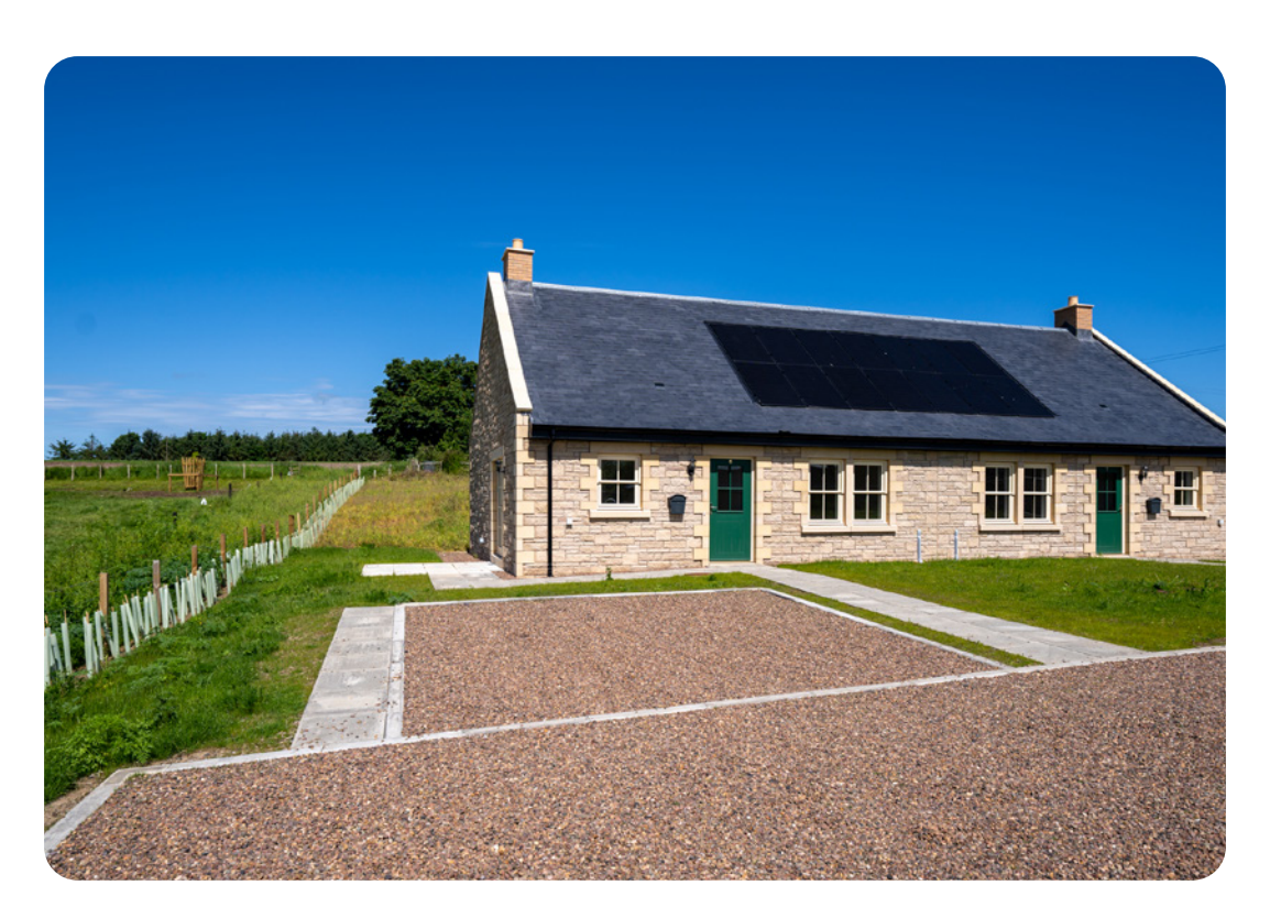
Image: Crooks\ Farm\ (Reproduced\ with\ permission\ from\ Hudson\ Hirsel\ LLP)