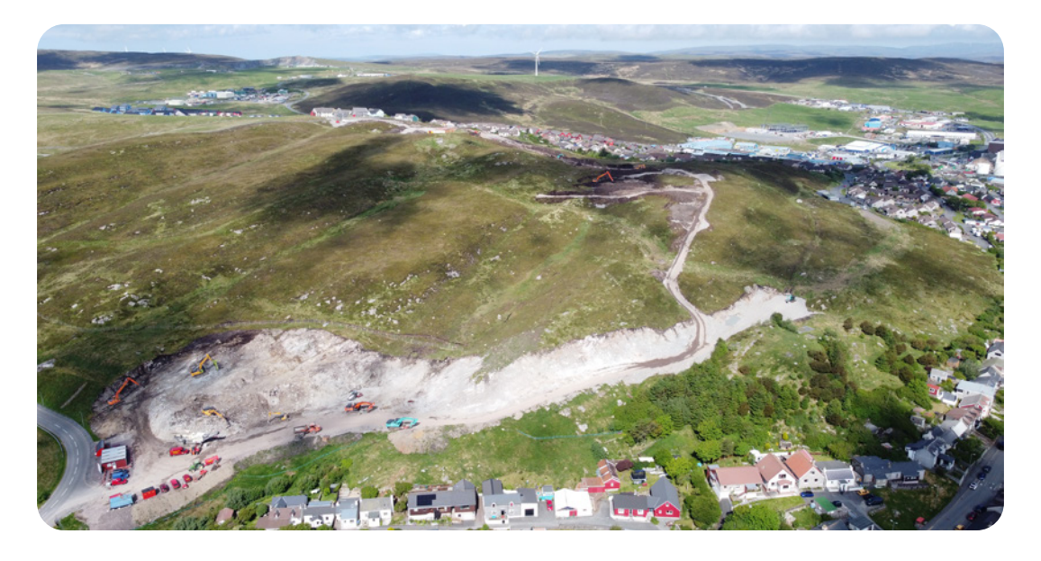
Image: North Staneyhill development site.

North Staneyhill is a large-scale housing development which is being undertaken by Hjaltland Housing Association in partnership with Shetland Islands Council and the Scottish Government. This three-phase development project will deliver up to 350 new homes over 10-15 years, mostly for social rent but with opportunities for low-cost home ownership via shared equity housing and rent-to-buy properties. Plots may also be made available in later phases for self-build or commission works without grant assistance.