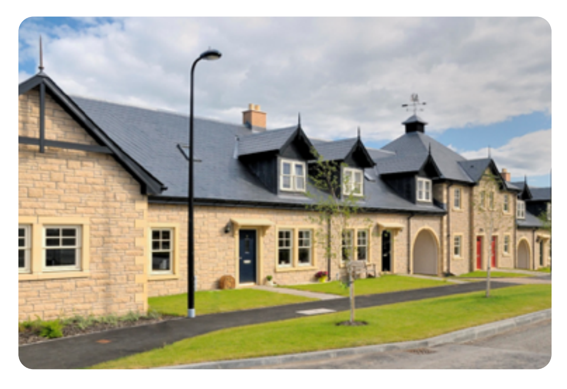
Image: Leet Haugh Phase 1 (Reproduced with permission from Hudson Hirsel LLP).

Leet Haugh and Crooks Farm are both located near Coldstream on the eastern boundary of the Hirsel, between the River Tweed to the south and estate-owned woodlands to the north. East Haugh is in the village of Birgham on the western boundary of the Estate.