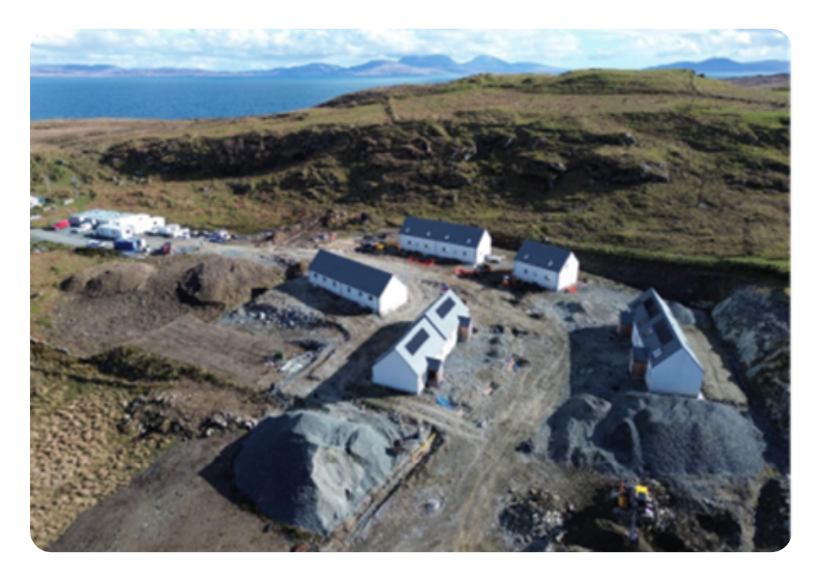
Image: Phase 1

Phase 1 will deliver a mix of two and three-bedroom detached and semidetached houses of different tenures, including: two homes for low-cost home ownership, with proposals for a Rural Housing Burden to be attached, which are available at up to 30% discount; four homes for affordable rent; and three local worker houses for staff of MOWI Scotland Ltd – the UK's largest supplier of farm-raised salmon – which all meet HMO requirements.