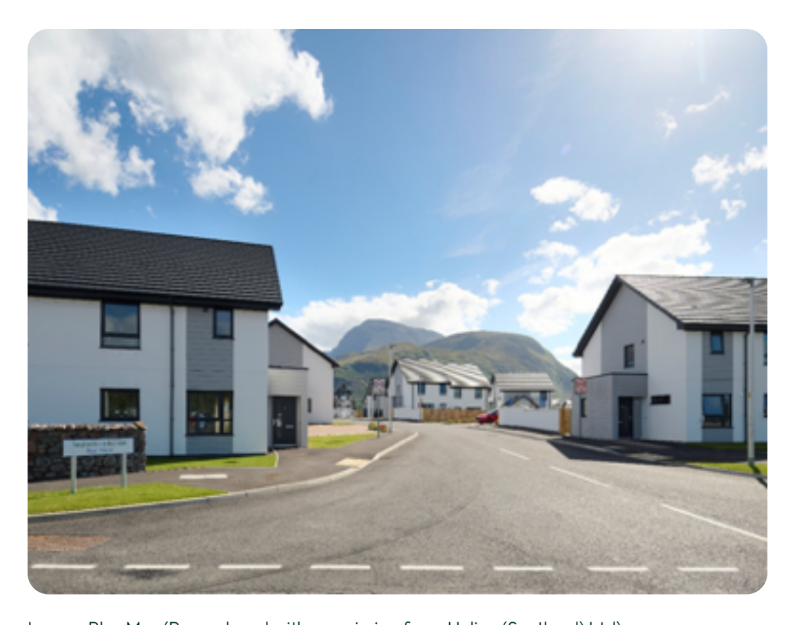
Image: Blar Mor

The site at Blar Mor in Fort William was purchased by the Highland Council with the vision to deliver 117 homes and a new hospital on the site which extends to over 40 hectares. There is a mix of homes for social and midmarket rent. The homes are a mix of one bedroom flats along with two- to four-bedroom homes. Work on the homes started in 2020 and there were phased handovers during 2022 and 2023.