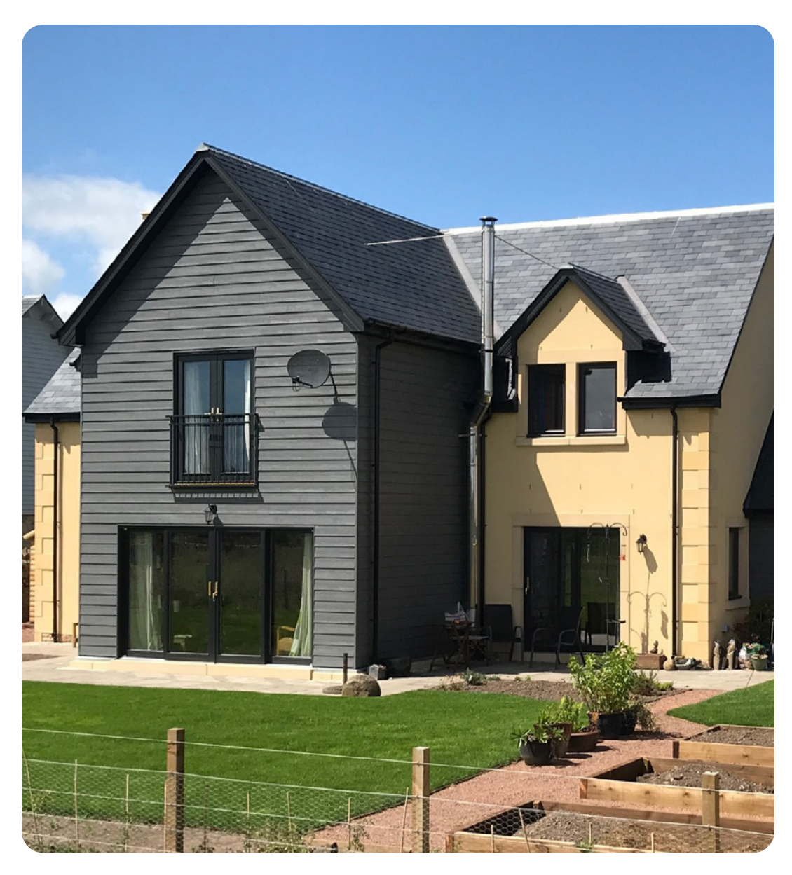
Image: East Haugh