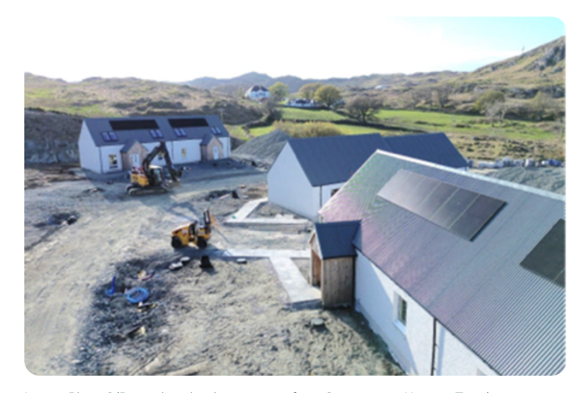
Image: Phase 1

The project adopts a "design and build" approach and employed TSL – a SME builder based on the Isle of Mull – to carry out the work. The final contract price was agreed with the contractor in July 2021 and the groundworks commenced in August 2021, completion is scheduled for July 2024.