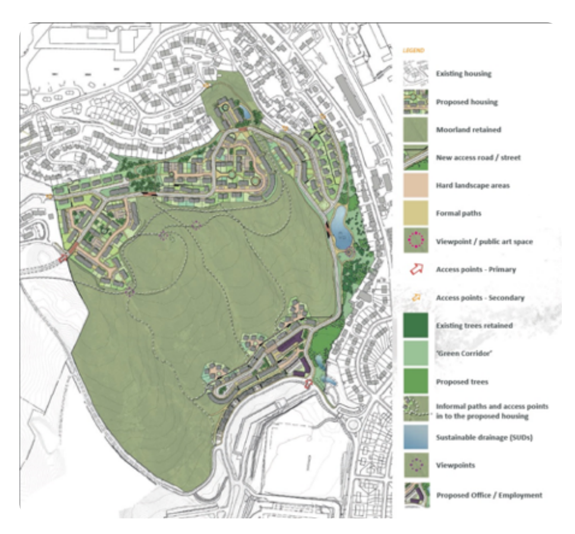
Image: Phase 1 masterplan, North Staneyhill (reproduced with permission from Hjaltland Housing Association).

The design of phases 2-4 has not yet been commissioned. However, the main services and infrastructure delivered in Phase 1 considers the requirements of future phases.