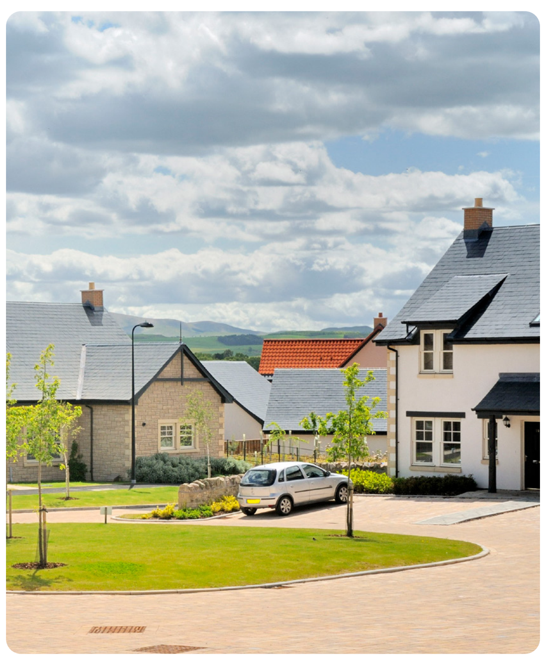
Image: Leet Haugh Phase 1

Some similar conclusions apply to the Borders, although it is a rather earlier stage than Highland. Community housing, for example, was said to be "in its infancy" compared to CHT in Highlands but expanding from Dumfries into Borders in recent years. SoSE has played a similar role to HIE, but is also much newer.