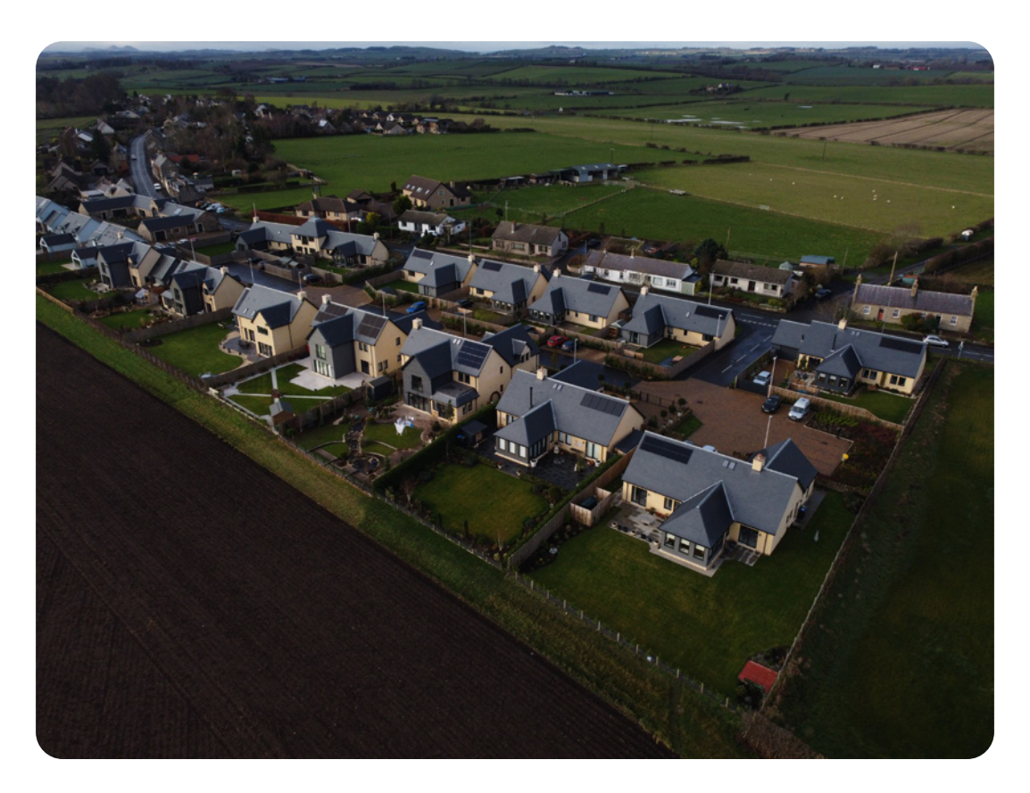
Image: East Haugh