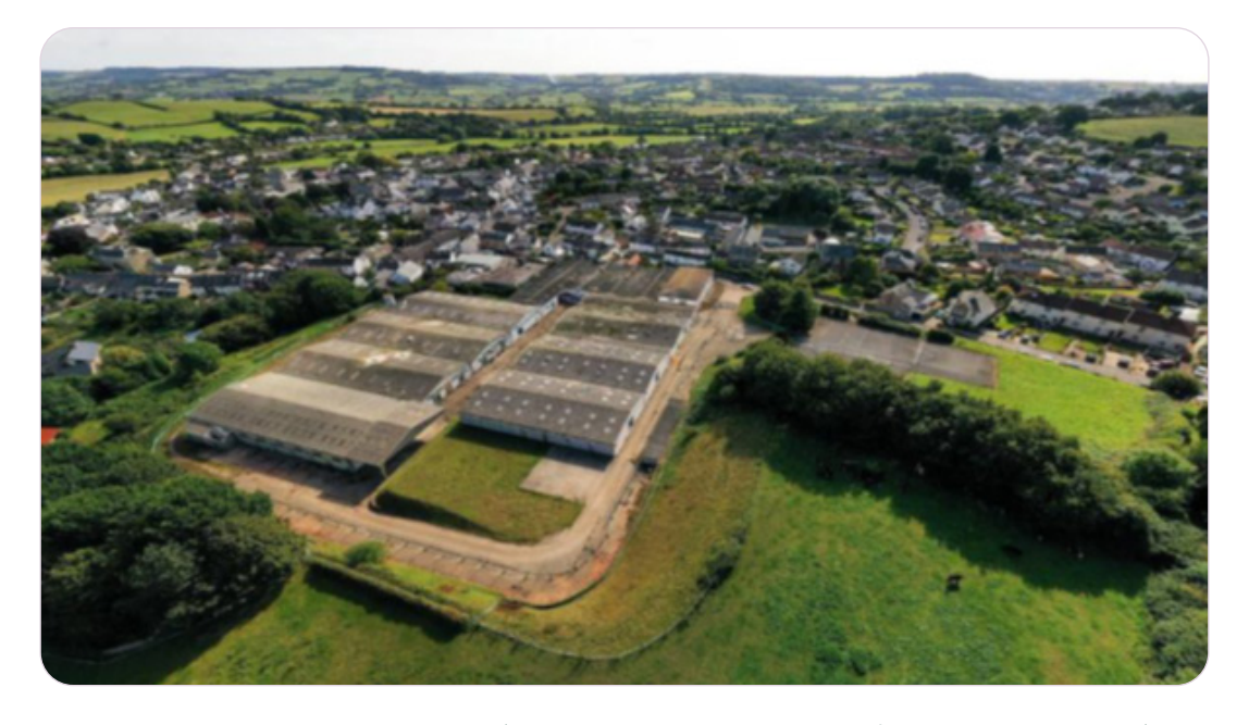
Image: Ceramtec site, East Colyton (reproduced with permission from Homes England)

existing buildings and the development of up to 72 new homes, with 20% of these as affordable housing. There would also be six light industrial units and high-quality public open space. The site was sold conditionally to a Regional Developer, which is now seeking planning consent.